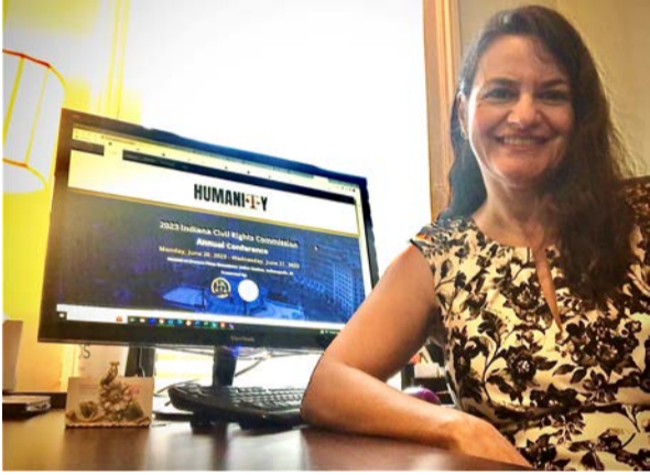
Nohemi attending the 2023 Indiana Civil Rights Commission Annual Conference.