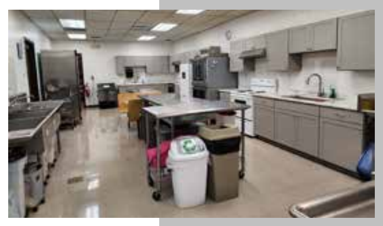
Our Shared Kitchen received a much-needed facelift in 2022, thanks to volunteers from Caterpillar and donations from Henry Poor Lumber.