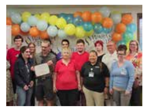
We celebrated the first graduating class of STRIVE participants at Wabash Center in 2022.

As we believe that earning a living wage is a fundamental human right, YWCA Greater Lafayette has partnered with Google to create STRIVE, a workforce development program that delivers digital skills training, essential workplace skills, and empowerment pieces to help participants feel confident in their own skills, strengths, and abilities.