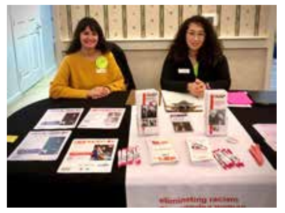
YWCA can often be found out in the community at outreach events, spreading awareness about our programs and services.

In 2022 YWCA Greater Lafayette Violence Prevention reached 14,594 people through crisis line callers, residential and non-residential housing support, support group attendees, and outreach education to adults and youth. In 2022, Violence Prevention had 6,740 callers on the 24/7 crisis line. Outreach Coordinators provided prevention education and healthy relationship programming to 7,167 people in Tippecanoe and surrounding counties.