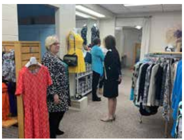
Dress for Success Greater Lafayette Boutique