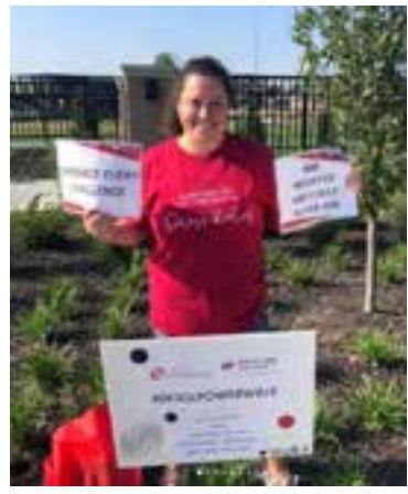
2021 Annual Report

48 registrants and raised $9,634 for Empowerment Services.